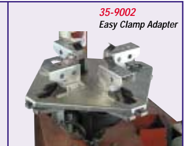
35-9002 Easy Clamp Adapter