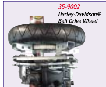
35-9002 Harley-Davidson® Belt Drive Wheel