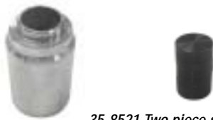
35-8521 Two piece set

YFM200 and YFM250 ATV applications. 35-8544 YM-1391