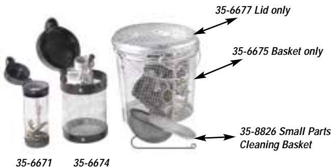
35-6677 Lid only

38-9194 Ultra Sonic Cleaning Solution. One gallon container. Makes 41 gallons of environmentally safe, biodegradable, multi-purpose cleaning solution.